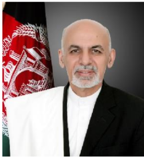
H.E. Dr. Ashraf Ghani President of the Islamic Republic of Afghanistan

Ashraf Ghani grew up in Afghanistan before pursuing his education abroad. Like so many Afghans, foreign invasion and civil war led to the persecution of his family and forced him to remain in exile. Whilst abroad, he became a leading scholar of political science and anthropology and then worked at the World Bank where he learned the tools of international development. Following the fall of the Taliban in 2001, he returned to Afghanistan to devote his unique skills and knowledge to rebuilding the country. He advised interim President Karzai and served as the Finance Minister in the Transitional Islamic State of Afghanistan until December 2004. During his tenure as Finance Minister, he designed a package of reforms and initiated several public investment programs that led to significant improvements in the livelihoods of ordinary Afghans across the country. He declined to join the newly elected government in December 2004. However, he remained an influential voice in political circles both in Afghanistan and abroad. He served as the chairman of the Transition Coordination Commission (TCC) in 2010 which was responsible for transferring authority from foreign to national troops. He resigned from TCC to run for president in October 2013. He was declared winner on September 22, 2014.